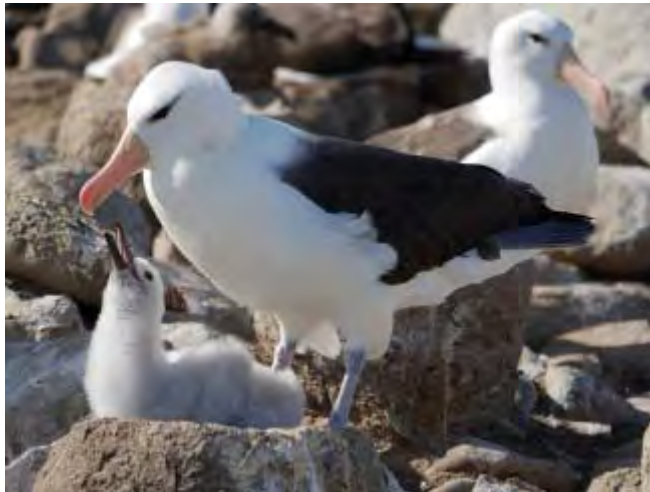
Black-browed Albatross and chick

to the place, as if everyone knows everyone.