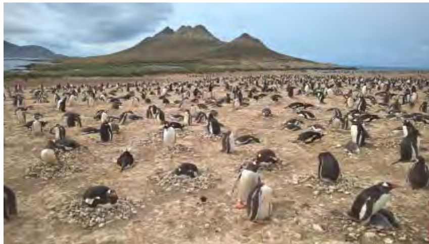
Gentoo Penguin colony with the east peaks of Steeple Jason behind

We made the most of our opportunity to study the island, doing a survey of beach litter as well as our seabird counts. Even in this remote place we found plastic bottles, wrappers and other debris. The recent Blue Planet series has done a lot to highlight the problems caused by plastic in the oceans. Reducing our use of single-use plastics is a good way to start tackling the problem.